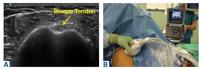
Figure 2. (A) Ultrasound image of the right shoulder. Short axis view of the long head of the biceps tendon as it exits t he groove. Yellow arrow indicates the biceps tendon. (B) Photo during surgery showing ultrasound use to localize the biceps tendon as it exits the groove, above the pectoralis major. The biceps tendon is centered on the screen, and the skin is marked to indicate the location of the anteromedial and anterolateral portal for arthroscopic biceps tendoesis.