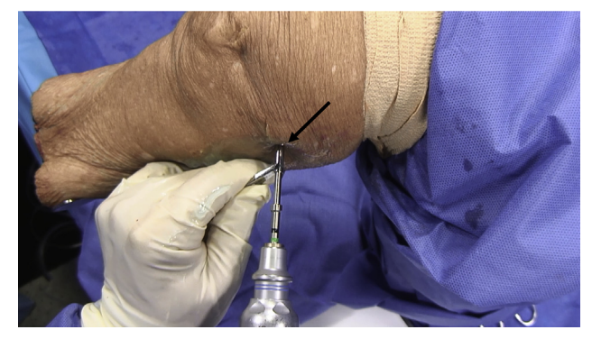
Fig 2. With the patient placed in a supine position, the right knee at 30^{\circ} flexion, and at neutral rotation, the femoral socket is seen being drilled (solid black arrow) from an exterior view.

(InternalBrace, Arthrex) of the MCL. Diagnostic ultrasound can be used to confirm the location of the anchors and the presence of the InternalBrace construct.