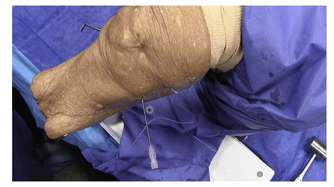
Fig 6. With the patient placed in a supine position, the right knee at 30° flexion, and at neutral rotation, the spinal needle (asterisk) in the tibial socket is seen from an exterior view. The spinal needle is placed into the socket after it is drilled to act as a marker for the eventual placement of the tibial anchor.

landmark palpation to guide anchor placement; however, palpation-guided procedures have proven to be inaccurate and unreliable as seen in comparison with ultrasound-guided injections and surgical procedures.<sup>24-32</sup> Using diagnostic ultrasound in this technique enables physicians to establish the anatomy and integrity of the MCL intraoperatively. The simple nature of the procedure makes it an excellent option for surgeons addressing damage to the MCL.