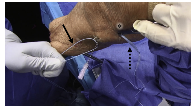
Fig 7. With the patient placed in a supine position, the right knee at 30° flexion, and at neutral rotation, the looped end of the FiberWire (solid black arrow) can be seen being passed to the femoral site from an exterior view. A plane is created between the femoral and tibial incisions by a 90° hemostat (asterisk), which is then used to pass the looped end of the FiberWire to the femoral site. The FiberTape (dashed black arrow) is then looped through the FiberWire and passed to the tibial site.

The suture tape augmentation and stabilization is not a reconstruction or repair of the MCL, but rather acts as a backstop, assuming forces that would normally be distributed through the ligament itself. As the MCL has the potential to heal on its own,<sup>21-23</sup> the augmentation and stabilization provides the necessary stability while