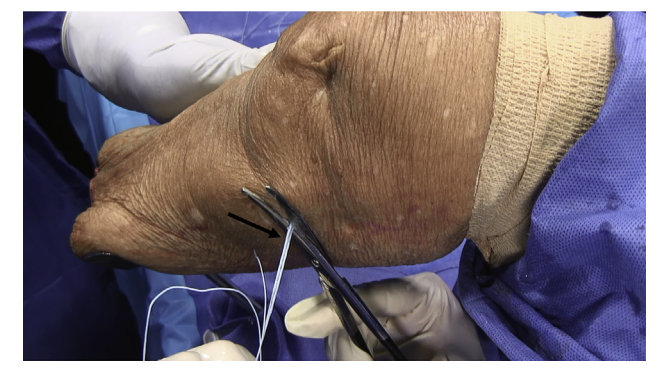
Fig 9. With the patient placed in a supine position, the right knee at 30° flexion, and at neutral rotation, the excess FiberTape (solid black arrow) can be seen from an exterior view. Once the tibial anchor has been fixed into position and the FiberWire sutures are removed, the excess FiberTape can be cut. This completes the procedure.

the natural healing processes occur. Grade III tears of the MCL, however, do not always heal and can require surgical intervention. In this setting, prolonged immobilization is necessary as a knee lacking medial stability during the early phases of recovery can dispose a patient to failure of the MCL procedure. Augmenting a repair or reconstruction with an ultrahigh-strength suture tape allows patients to begin their rehabilitation earlier without fear of putting the construct at risk. This simple procedure would then allow for natural healing and prevent late reconstruction of the MCL. Because reinforcing the MCL in this way negates the need for immobilization and allows natural healing to take place, patients can