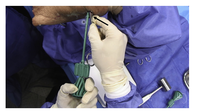
Fig 4. With the patient placed in a supine position, the right knee at 30° flexion, and at neutral rotation, the BioComposite Vented SwiveLock (asterisk) and a Kelly clamp (solid black arrow) can be seen from an exterior view. The Kelly clamp is used to ensure that the anchor is fully seated to the bone.

traditional operative MCL protocols. Because of the augmentation and stabilization, we can begin rehabilitation earlier with a focus on passive ROM. There is no longer a need for a knee immobilizer or crutches. The procedure allows for early weight bearing as tolerated and up to 90° of knee flexion within the first 4 to 7 days with full passive ROM by 4 weeks. Crutches are not needed if gait mechanics are adequate. Early physical therapy consists of passive and active ROM as well as closed chain strengthening in the pain-free range. Therapy plays a critical role in proper mechanics and graded supervised activities helping to decrease fear avoidance behaviors seen in knee surgeries. During the strengthening phase, loading is progressive, but deep knee squats are avoided to allow the MCL to heal. Over the next 1 to 3 months, the patient progresses to full strength, lifting, and normal daily activities, but lateral movements are limited as the construct matures and integrates. Return to sports and heavy lifting activities are achieved by 3 to 4 months. Once the patient has met all of the strength, ROM, and functional outcome measures, no brace will be required for return to sport.