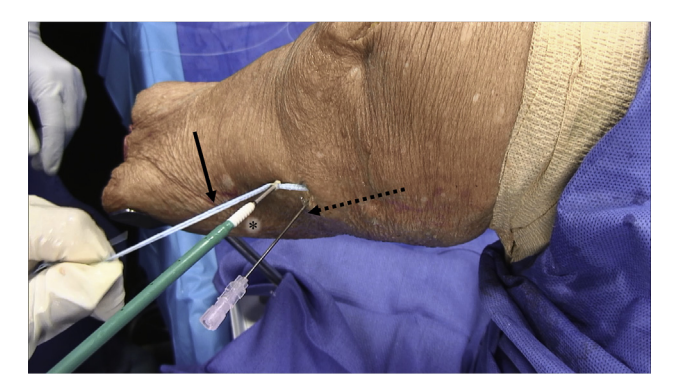
Fig 8. With the patient placed in a supine position, the right knee at 30° flexion, and at neutral rotation, the tibial anchor can be seen at the tibial site from an exterior view. The BioComposite Vented SwiveLock (asterisk) attached to the FiberTape (solid arrow) will be fixed into the tibial socket. In this image, the spinal needle (dashed arrow) is sitting in the tibial socket. The spinal needle acts as a marker for the location of the socket, while a plane is established between the 2 incisions and the FiberTape is passed from the femoral anchor. After removal of the spinal needle, the BioComposite Vented SwiveLock can be fixed into position.

the natural healing processes occur. Grade III tears of the MCL, however, do not always heal and can require surgical intervention. In this setting, prolonged immobilization is necessary as a knee lacking medial stability during the early phases of recovery can dispose a patient to failure of the MCL procedure. Augmenting a repair or reconstruction with an ultrahigh-strength suture tape allows patients to begin their rehabilitation earlier without fear of putting the construct at risk. This simple procedure would then allow for natural healing and prevent late reconstruction of the MCL. Because reinforcing the MCL in this way negates the need for immobilization and allows natural healing to take place, patients can